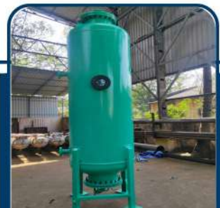
RUBBER LINING VESSEL

CAPACITY : 15.4m 3 /hr MOC : SS316L TYPE : BASKET FILTER CUSTOMER : INDIAN ADDITIVES LIMITED, CHENNAI