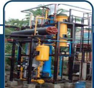
AMMONIA ABSORPTION SKID

CAPACITY : 160°C / 5.2 (kg/cm 2 ). MOC : CS. TYPE: HOT WATER HEATER. CUSTOMER : ANNA UNIVERSITY,CHENNAI.