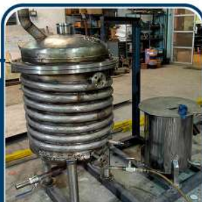
CHEMICAL REACTOR SKID

CAPACITY : 10TR MOC : CS/SS304. TYPE : VAPOUR ABSORPTION SYSTEM. CUSTOMER : UNIVERSITY OF TAIWAN,TAIWAN.