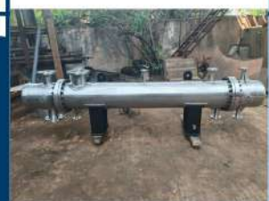
SHELL & TUBE HEAT EXCHANGER

CAPACITY : 18.8m 2 . DES.PR. : 12kg/cm 2 g. MOC : 316L. TYPE : BES. CODE : ASME SEC VIII & TEMA. CUSTOMER : INDIAN ADDITIVES LIMITED, CHENNAI.