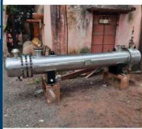
SHELL & TUBE HEAT EXCHANGER

CAPACITY : 18.8m 2 PROCESS FLUID : SHELL : AIR / TUBE : THERMINOL 66 DES.PR : 17kg/cm 2 g MOC : SA179 / ALUMINIUM FIN TYPE : FIN FAN COOLER CODE : GOOD ENG PRACTICES. CUSTOMER : INDIAN ADDITIVES LIMITED.