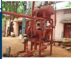
HOT WATER HEATER SKID

CAPACITY : 5m 3 . MOC : 304L. CUSTOMER : NGIL, KERALA.