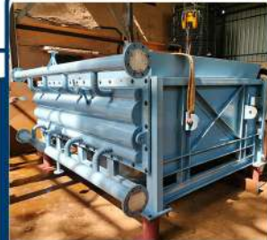
AIR COOLED HEAT EXCHANGER

CAPACITY : 32.65m 3 DES.PR : ATM MOC : 316L TYPE: STORAGE TANK CODE : API650. CUSTOMER : INDIAN ADDITIVES LIMITED, CHENNAI.